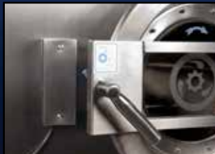
EASY TO USE DOOR HANDLE