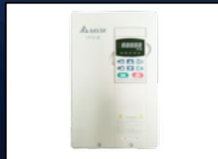
SINGLE MOTOR DRIVE