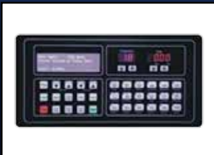
EASY TO USE CONTROLLER